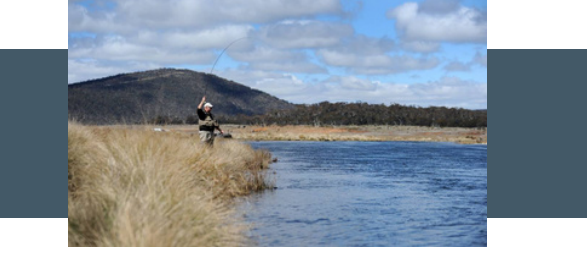
Autumn fishing on the Eucumbene River

The spawning season arrived with the fish in excellent condition. There was a good run of spawning brown trout in the Eucumbene River by late May. Some impressive fish were caught, and many were released. The MAS has done a lot of work over the last 10 years to get rid of the cowboys